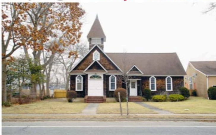
The Wolpert Building, a former sanctuary, is named for one of the founders of Islip Terrace.