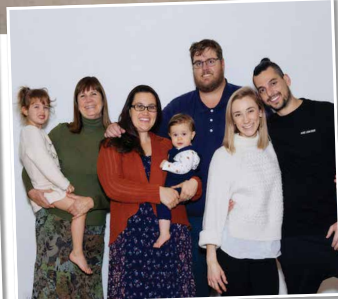
Three photos provided by Amy Frelinger